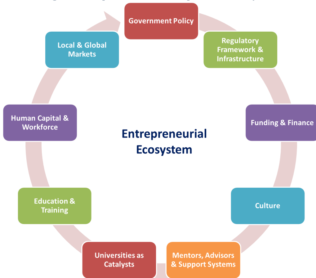
Figure 2: Components of the Entrepreneurial Ecosystem

Adapted from: Isenberg (2010); World Economic Forum (2013)